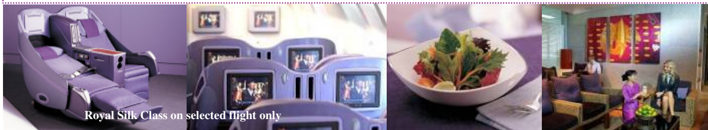
Royal Silk Class on selected flight only

To enjoy the Business class air ticket with the exclusive facilities, please check the special price at our hotline. 提升至商務機艙及其尊貴服務,詳情請聯絡皇家風蘭假期熱線。