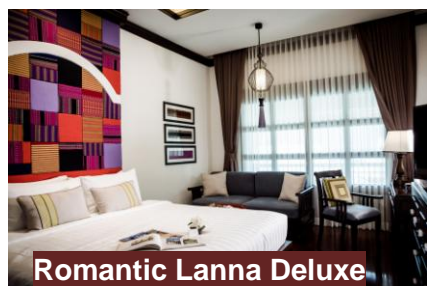
Romantic Lanna Deluxe